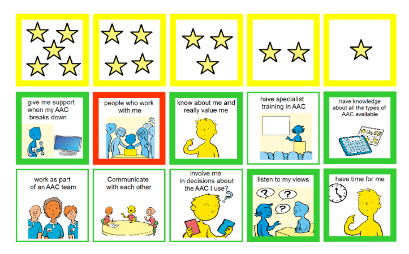
Figure 4 Examples of symbols used with Talking Mats

All symbols copyright Adam Murphy2013 and owned by Talking Mats Ltd.