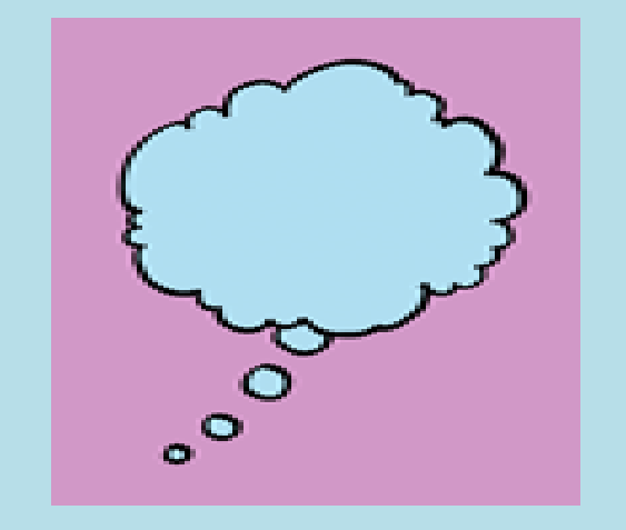
Your well being