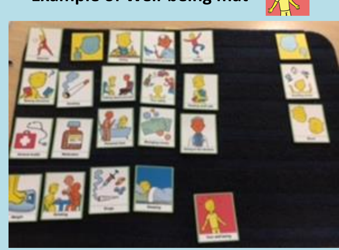
He recognised that lots of things were going well in his life but that he wasn't handling stress