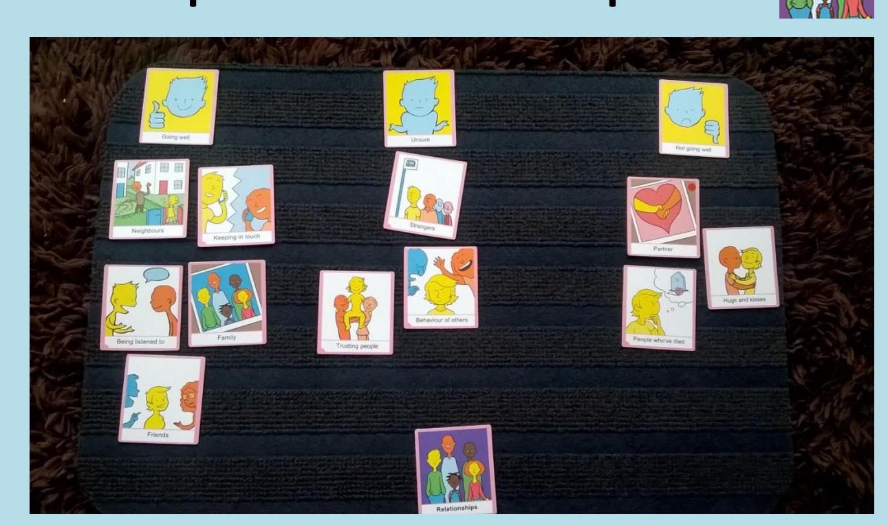
'Wants to meet his girlfriend out with the day centre, but doesn't know how to organise this'