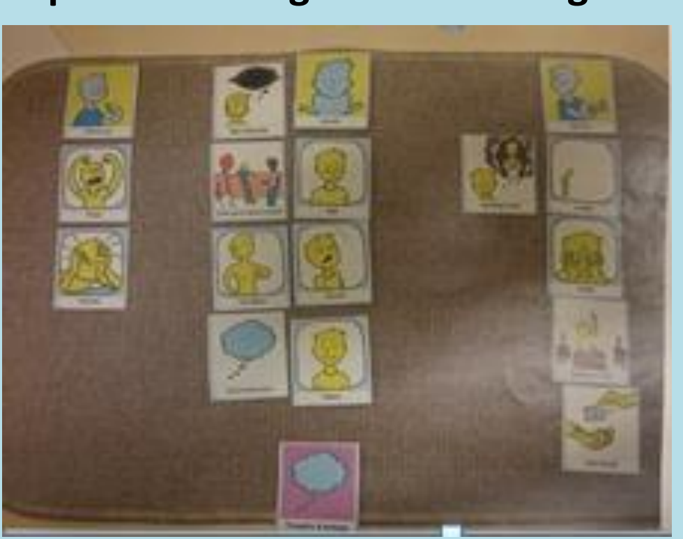
From this mat we found out she was worried'