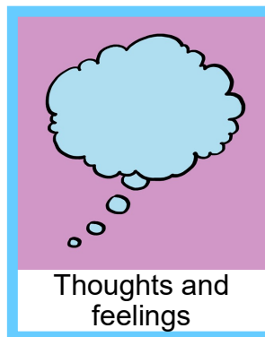
Thoughts and feelings

The Keeping Safe resource gives people an opportunity to reflect on how their lives are going; It supports safeguarding by allowing issues of concern to arise through this supported conversation .