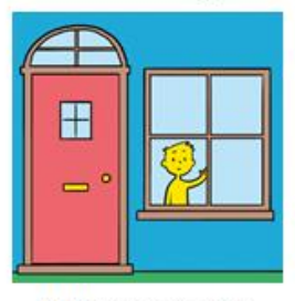
Where you live